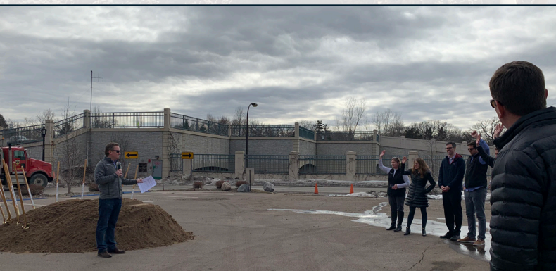
This page: Reuter Walton Development owner, addresses the crowd at the Shale Apartments ground breaking in Minneapolis, MN on March 4, 2020

It is very simple. I only hire general contractors recommended by the Carpenters Union that I know will hire union subcontractors. Now that I know more about the Union's practices, I believe they are put in place to ensure that abuses are not occurring on building sites. I also require contractors to sign a contract holding them accountable for their actions and their treatment of employees.