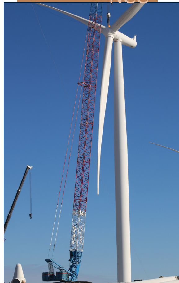
Cranes are used to hoist the new, longer blades into position on the wind turbine.

Mortenson started this project turning over one wind tower every three days. Now, they have created efficiencies reducing the ratio to one tower every ten hours. On the other hand, a nearby non-union contractor on another part of the project was turning over one wind tower every week. They have since progressed to one tower every three days, but it is nowhere near their union counterparts. In fact, Eric’s crew has quadrupled the output of the non-union contractor. The output has been so significant the owner of the wind towers hired Mortenson’s union employees to supplement the non-union contractor who fell far enough behind to compromise its federal tax incentives. Mortenson backed up