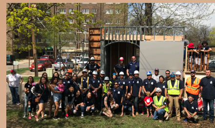
Carpinteros, supporters and families at the Cinco de Mayo Parade in West Saint Paul, MN