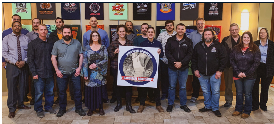
In November 2019, NCSRCC held the first Work Boots to Wingtips Candidate Bootcamp to help prepare members who are interested in running for office or playing a major role in campaigns. Another Bootcamp is in the works for this summer. Dates will be announced later this year.

Regardless of whether you are a Democrat, Republican, Independent or have another political affiliation, we encourage you to get involved in 2020. Let your politicians and neighbors know that you are a proud union member and support union values. Please remember we are strongest when we all participate. Reach out to your Regional Council’s Political Directors on how to get involved and watch for future updates.