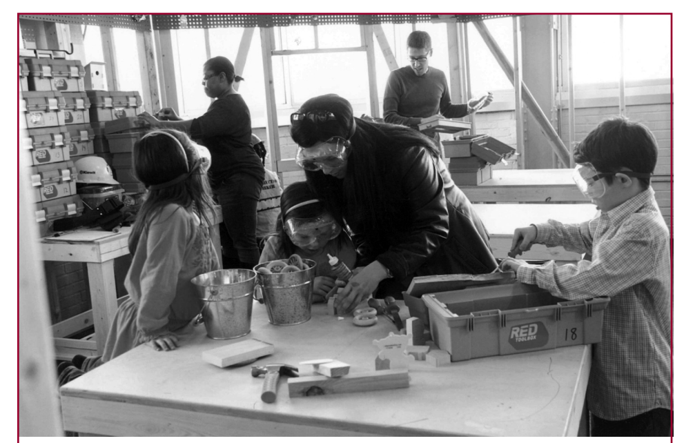
Each year, the Omaha Children's Museum sponsors a construction-based exhibit to engage community members. This year's exhibit, Construction Zone: Return of the Bulldozer, featured various zones where children could use real tools and design and build their own construction projects. Last year, apprentices in Nebraska donated their time and skills to build the general structure for the exhibit. This year, apprentices built the project tables and work spaces for the children to use during their time at the museum.

For more information, go to www. dot.state.mn.us/stcroixcrossing/.