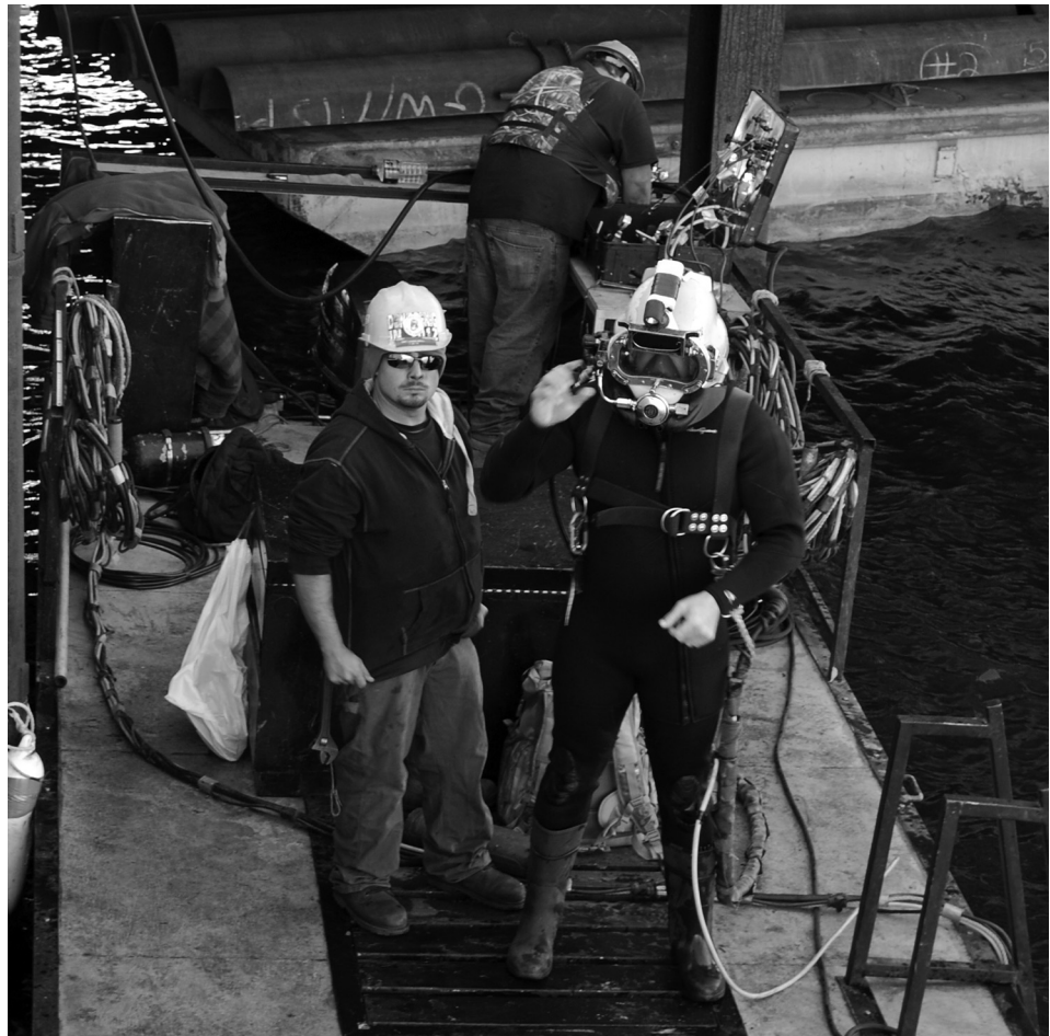
A member of the Great Lakes Diving and Salvage team prepares to enter Lake Superior to build steel jacket plates around the I-beams that support a Midwest Energy Resources Company pier in Superior, Wis. The jackets will help protect the pier from ice and corrosion.