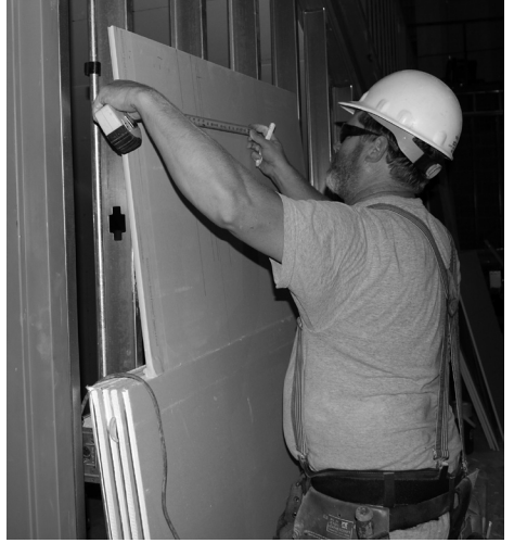
Indianola, IA — Graham Construction Company of Des Moines, Ia., constructed The Kent Campus Center, a $14 million, 54,000-square-foot student center at Simpson College in Indianola. The new campus hub features an expanded bookstore, coffee shop, yogurt shop, casual student dining options and a large second floor room overlooking Buxton Park. It includes a black box performance space, spacious student meeting rooms and offices for student groups, career services, health services and other administrative offices.