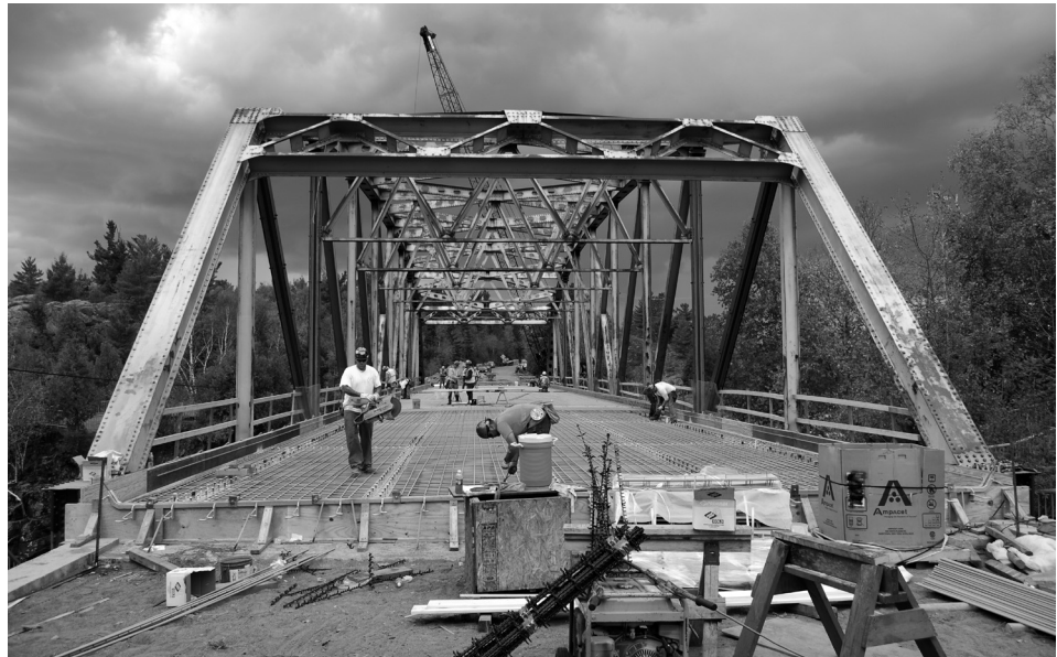
Northland Constructors rehabilitated the State Highway 210 bridge over the St. Louis River between Thomson and Carlton, Minn., that was washed away during severe flooding in July 2012. Cost on the project was $2.75 million.