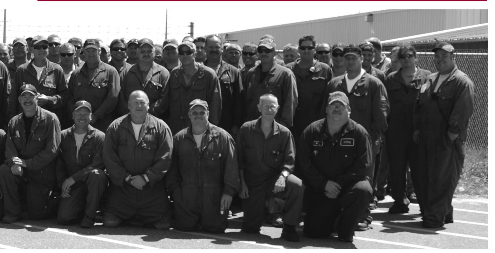
Pine Bend Refinery. The plant and its employees hold the plant's best safety record ever.