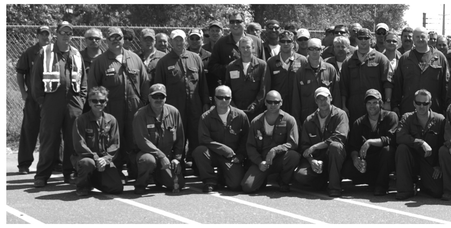
There are currently about 100 carpenters from CBI and millwrights from S.T. Cotter Turbine Services, Inc., on site at Flint Hills Resources'