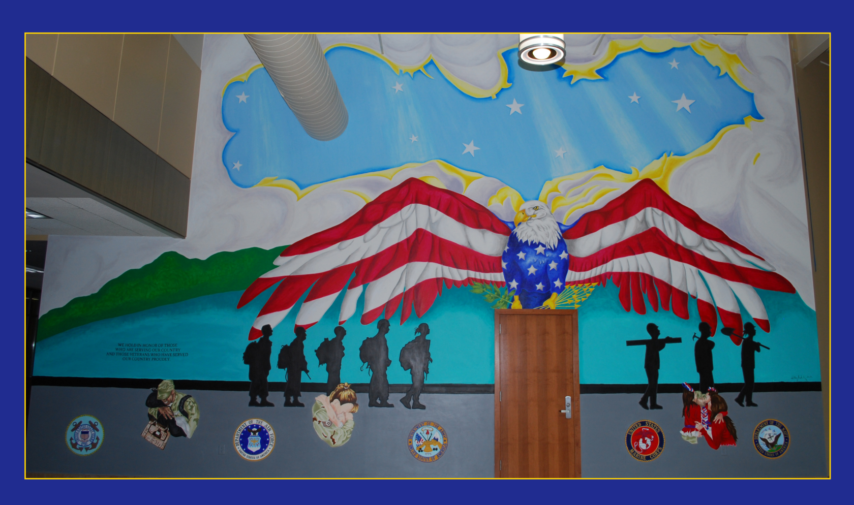
We hold in honor those who are sewing our country and those veterans who have sewed our country proudly

North Central States Regional Council of Carpenters 700 Olive Street Saint Paul, MN 55130