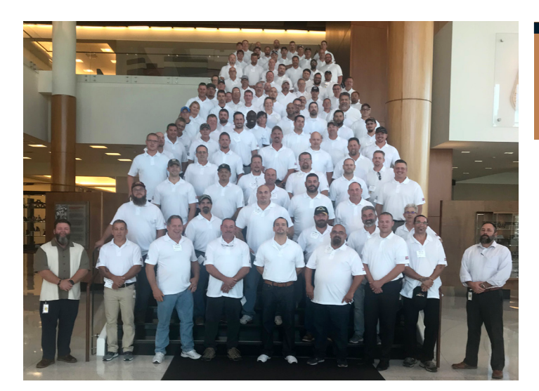
One hundred members attended the 212 Journeymen: Next Level UBC Leaders program at the International Training Center in August.